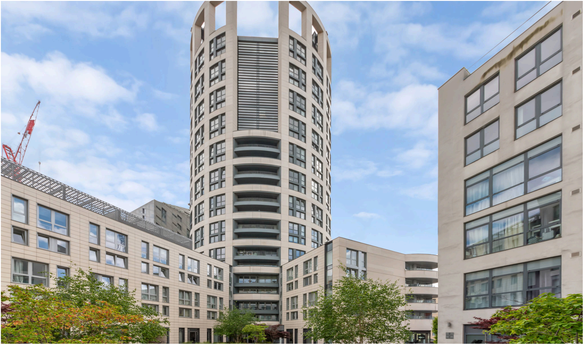
Eagle Point, Old Street, EC1V